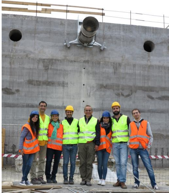
Figura 6. Pictures of the Civitavecchia Port during the installation of the Wells turbine and of the caisson equipped with the monitoring system (November 2015 – March 2016).