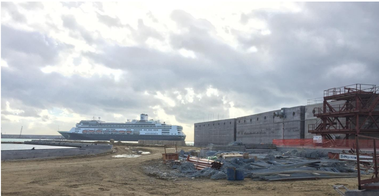
Figura 5. Pictures of the Civitavecchia Port during the construction of REWEC3 caissons.