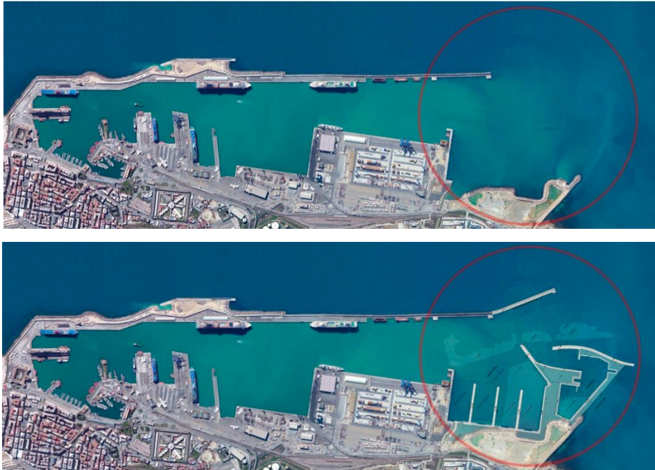
Figura 4. The Port of Civitavecchia in 2011 (upper panel) and after the building of the new dock (lower panel).